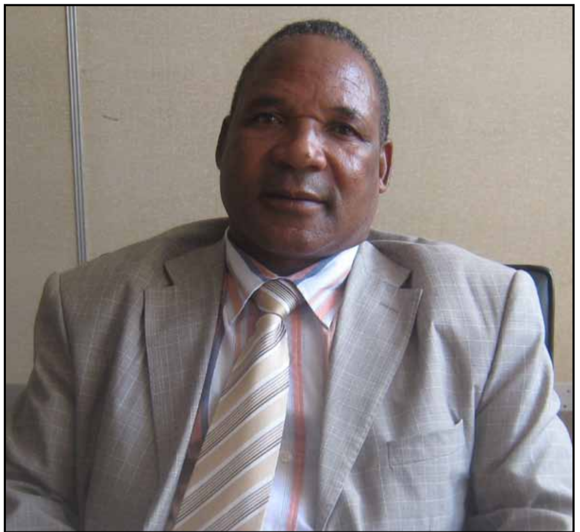
Masvingo Mayor Alderman Femius Chakabuda

He said the residents were also eager to see the maternity facility being extended to Rujeko high density suburb but however, lack of funding was blocking progress.