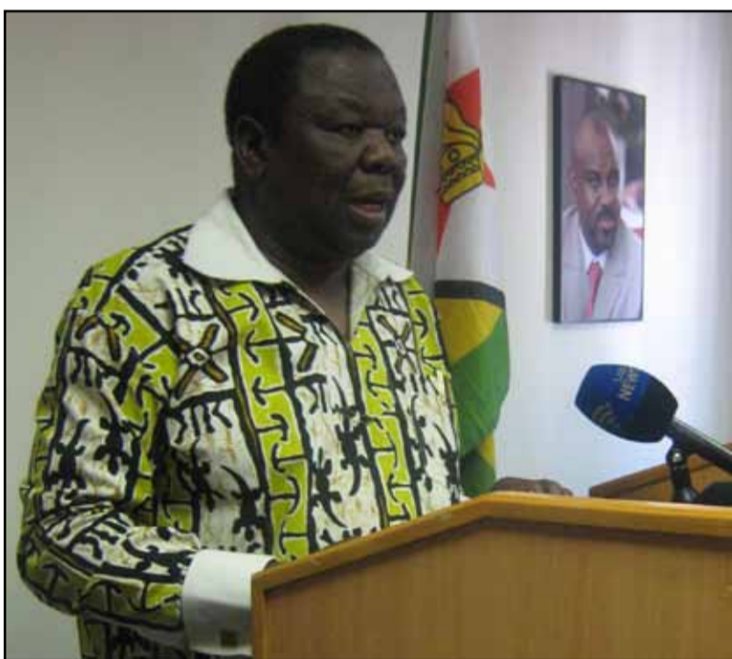
President Morgan Tsvangirai addressing journalists in Harare on Sunday

The national council called for the convening of an urgent SADC summit to resolve all the outstanding issues of provincial governors, national heroes, the swearing-on of Hon Roy Bennett, the issue of the RBZ governor Gideon Gono and Attorney-General Johannes Tomana, the review and reallocation of ministerial mandates, the chairing